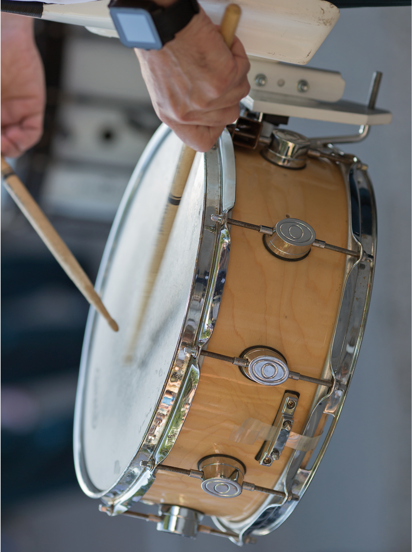
Creative Expression (Week 16, Day 1; Week 17, Day 3; Week 18, Day 1) Snare drum