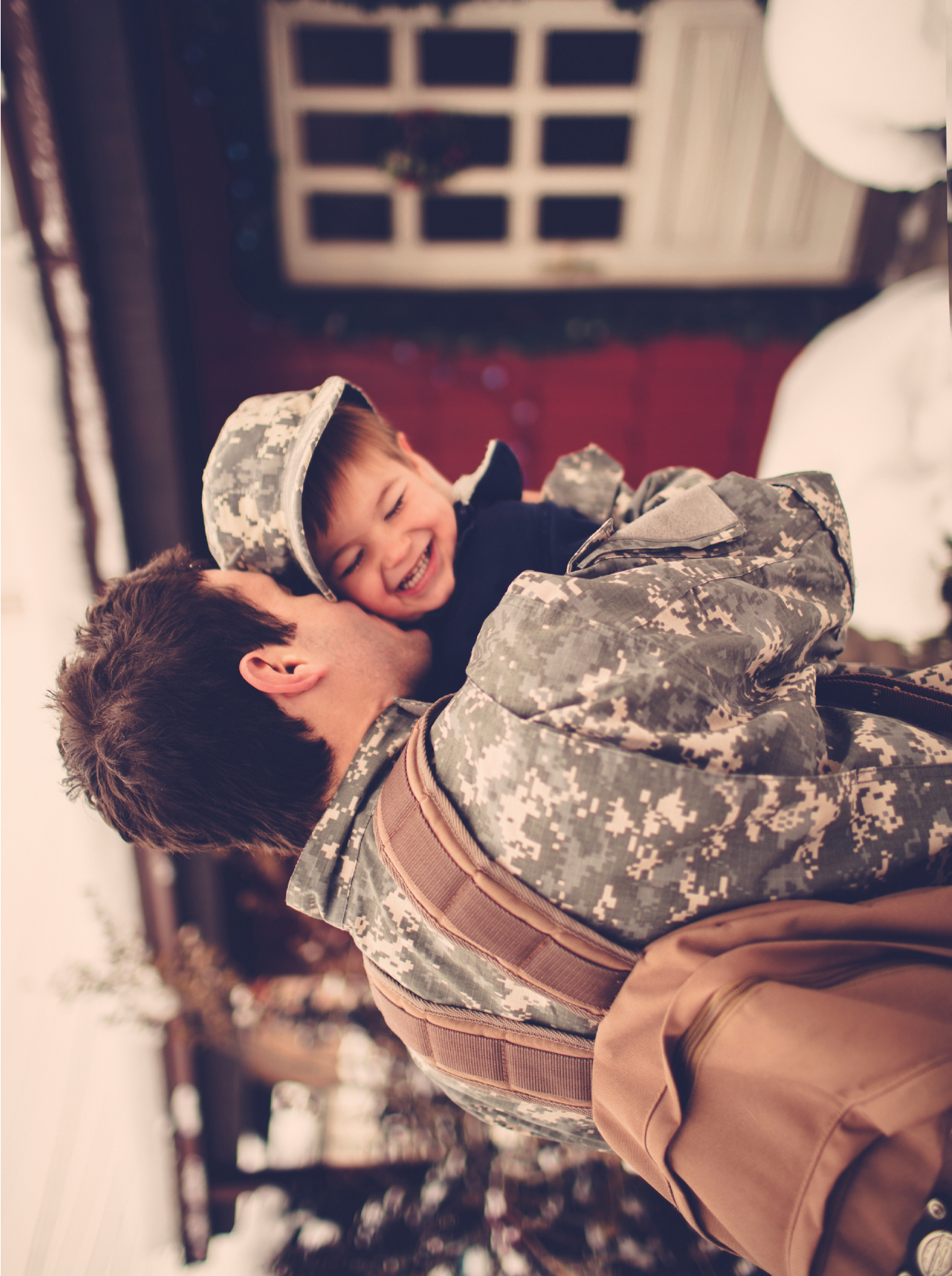
Social-Emotional (Week 17, Day 2) People showing love—Dad hugging boy