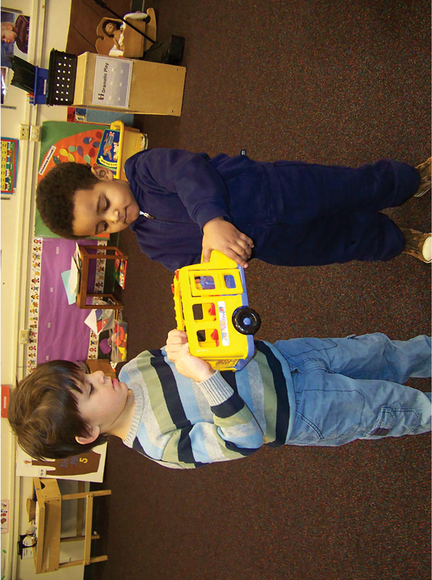
I can give my friend a toy that I want to share

Social-Emotional (Week 2, Day 3) Asking a Friend to Play-Share a Toy