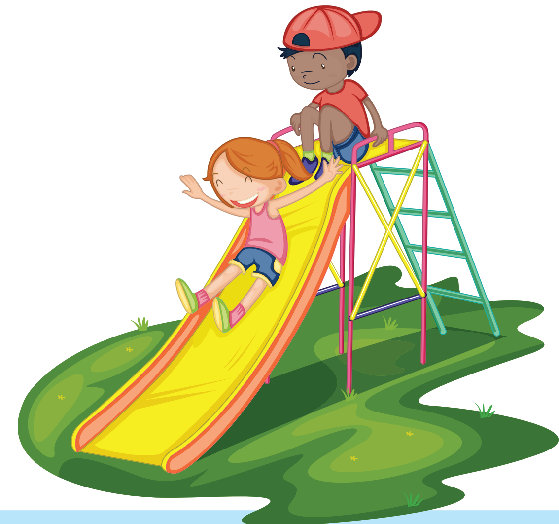
After you play outside