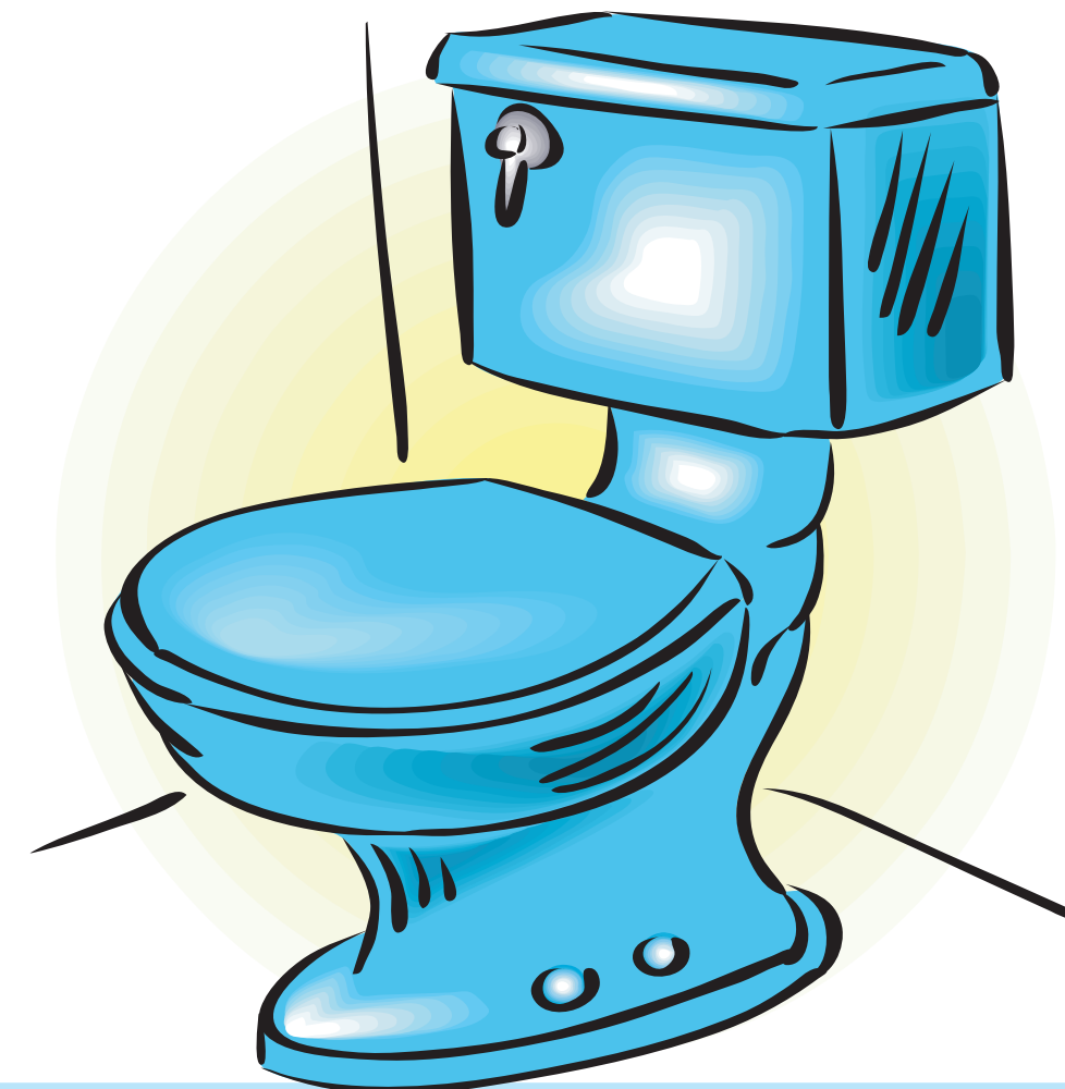
After you go to the bathroom