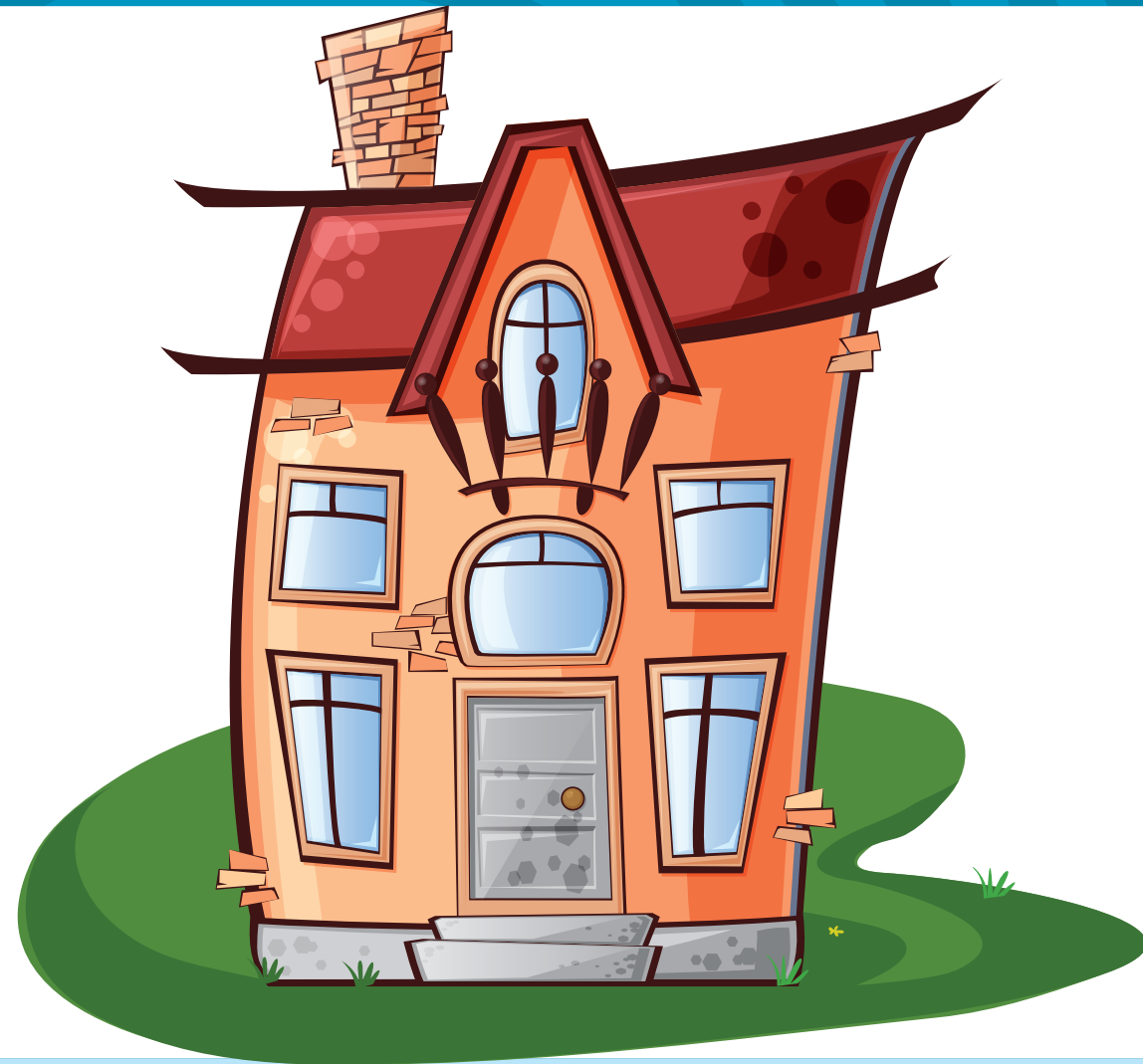
When you get home