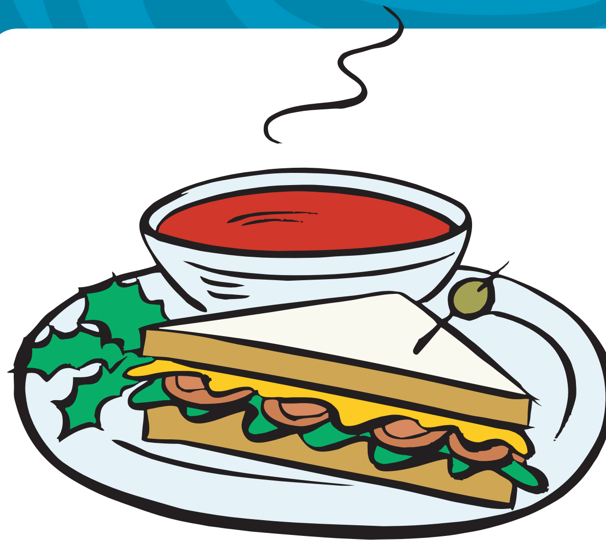
Before you eat