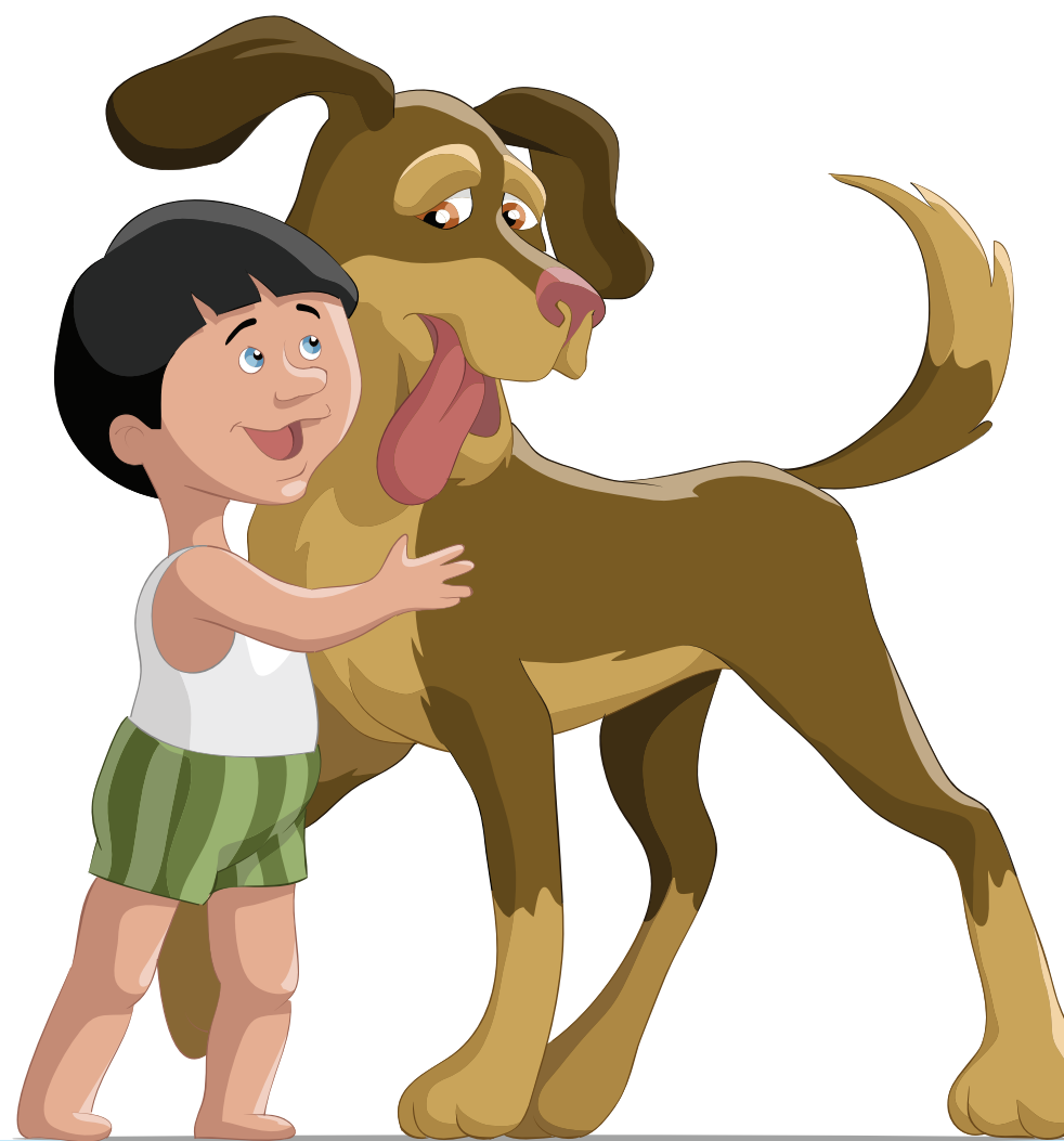
After you play with your pets