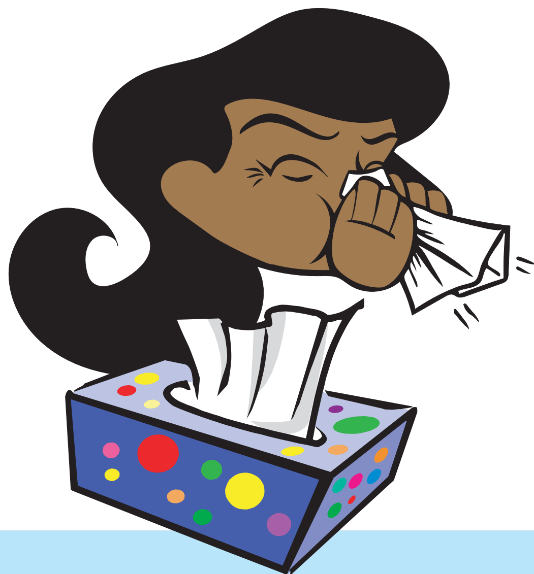
After you sneeze or cough