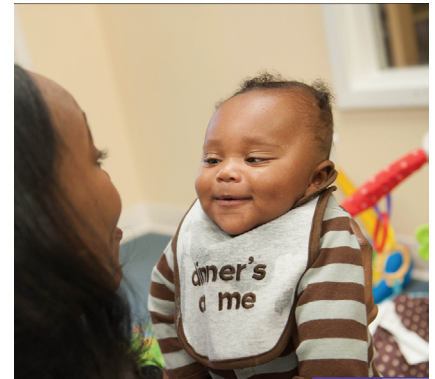
CDC Milestones in Action

Smile and begin talking with the infant. Example: “Good morning, Hannah. I am happy to see you!” Make a happy face toward the infant and watch for his/her response. The young infant may show interest in interacting by vocalizing, gazing at you, or reaching toward you. Acknowledge the infant’s reactions, including any vocalizations or gestures. Examples: “You are watching me, Samuel. You are smiling ! I am smiling back at you!” “I hear you saying ‘ba-ba-ba.’ You are talking to me, Caris! ‘Ba-ba-ba.’”]